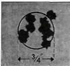
The target above was shot at 50 yards in machine-gun test with a 10-inch barrel. All shots hit the 3/4-inch circle.