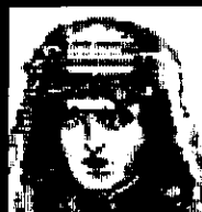
Col. T.E. Lawrence Room 119