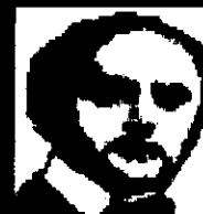
Harry Houdini Room 108