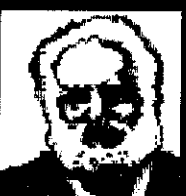
Alexander G. Bell Room 123