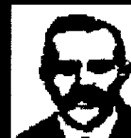
Baron Rothschild Room 109