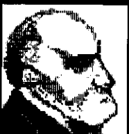
Leopold Auer Room 118