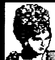
Lady Doyle Room 102