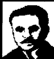
Lord Astor Room 201