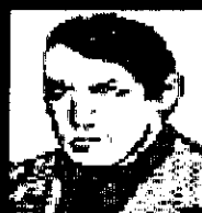
Picasso Room 114