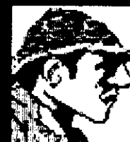
William Gillette Room 103