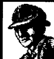
Sherlock Holmes Room 101