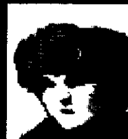
Lady Astor Room 201