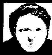
Gertrude Stein Room 115