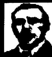
Conan Doyle Room 102