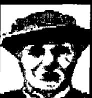
Thomas Edison Room 122