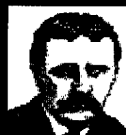
Tareyton Jr. Room 125